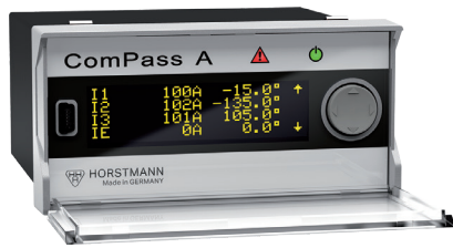
ComPass A 2.0

Short-circuit and earth fault indicator with monitoring