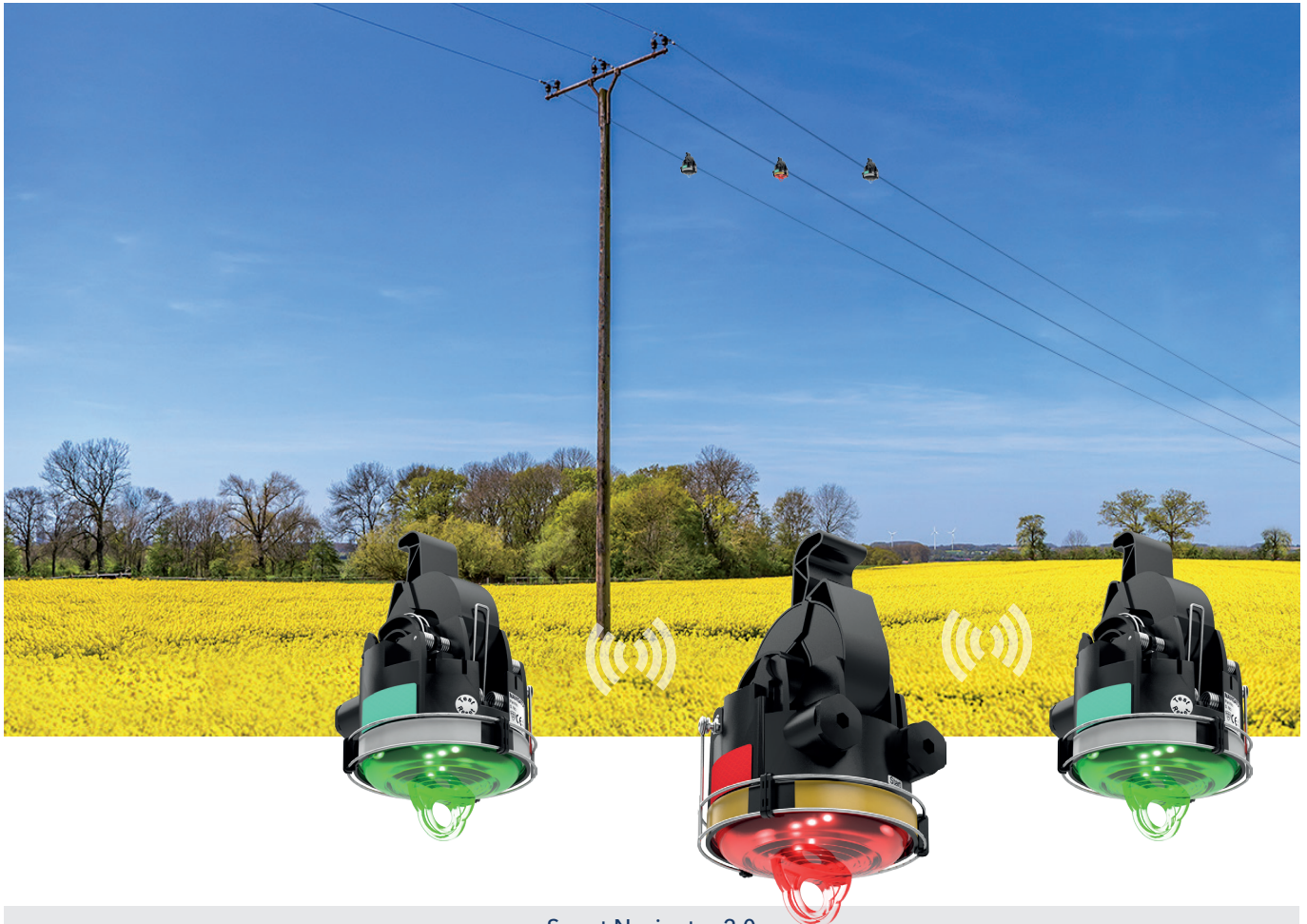
Smart Navigator 2.0

High-precision measurement for overhead lines